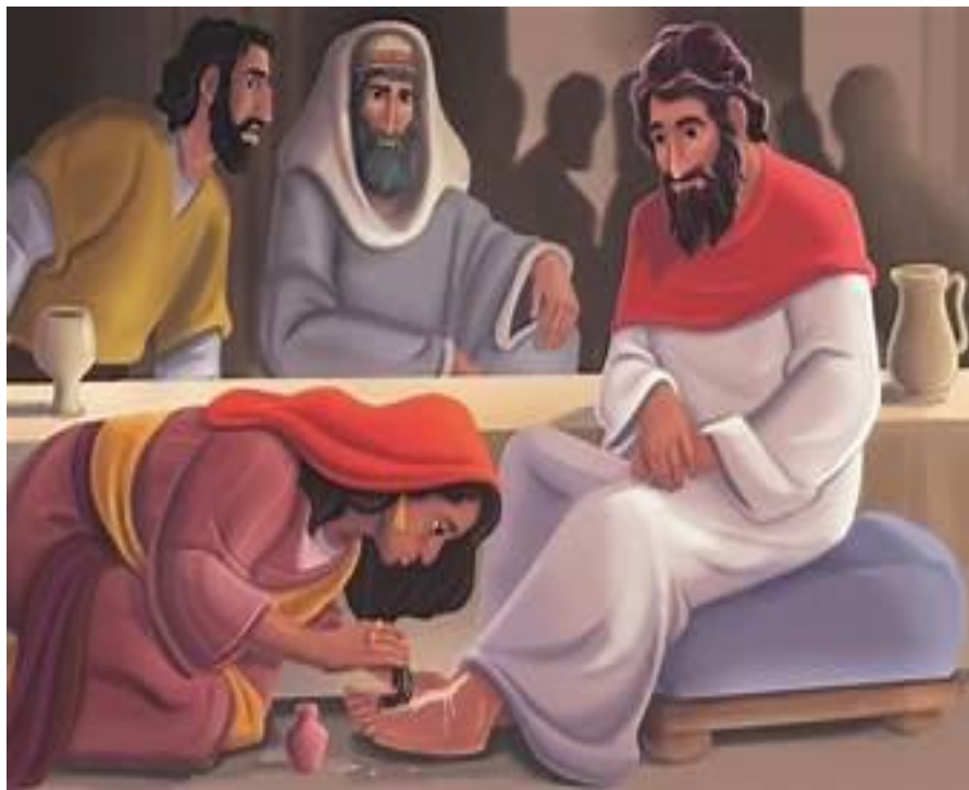
Mary Anoints Jesus

Fourth Sunday in Lent April 6, 2025, 10:00 a.m.