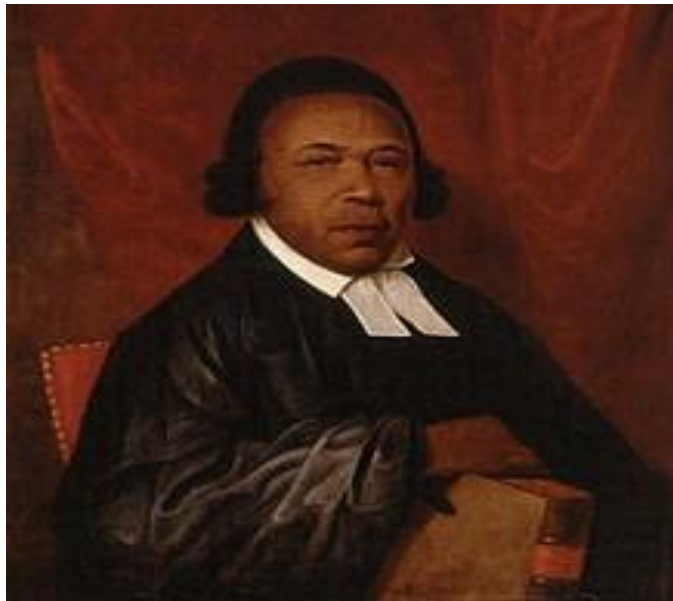
Absalom Jones, Priest 1818