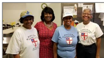
Fourth Tuesday supper service at Grace Mission on June 26