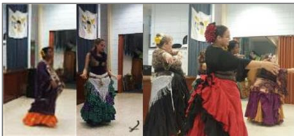
Khaleegy style dancers