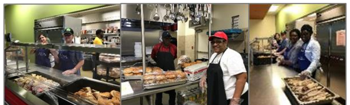
Serving dinner at The Kearney Center on June 6