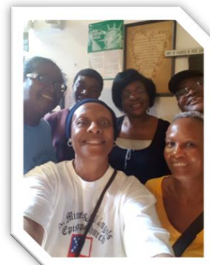
Serving at Grace Mission

On Wednesday, May 3, St. Michael will continue our outreach into the community by serving supper at The Kearney Center , a comprehensive emergency services facility that connects homeless individuals with resources to support stability and wellbeing. This is a joint ministry of St. John's and St. Michael on the first Wednesday each month.