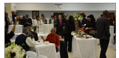
Meeting and greeting during the reception