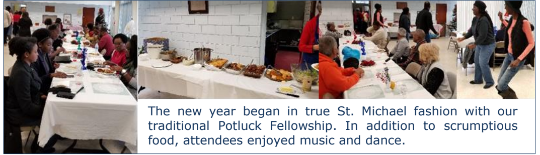
The new year began in true St. Michael fashion with our traditional Potluck Fellowship. In addition to scrumptious food, attendees enjoyed music and dance.