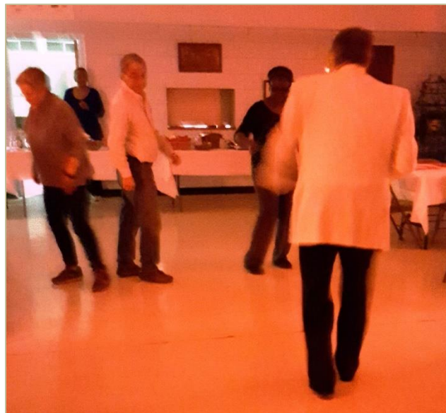
Cutting the rug at our Valentine's Day dance.