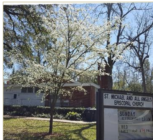
A dogwood tree in full bloom near Brooks Hall.