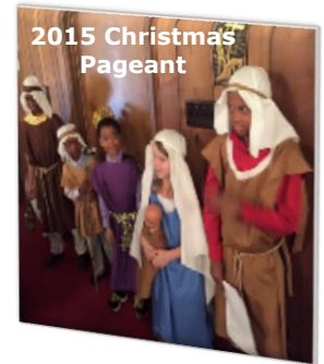
2015 Christmas Pageant

At St. Michael & All Angels, the spiritual development of our young people that begins with their baptism, is nurtured through our church school, participation in church ministries and attendance at diocesan events and activities. We view our church school as just the beginning of a lifelong, spiritual journey where children and youth are nurtured in their faith, as well as the teachings and traditions of the Episcopal church. In addition to learning from the Episcopal Church Curriculum developed by the Center for the Ministry of Teachings at Virginia Theological Seminary, our youth are involved in special performances during the year, including a Christmas Pageant, Easter Program and Father's Day recognition. Our young people also grow spiritually through serving as lectors, greeters and ushers, and singing with the children's choir at one Sunday service each month.