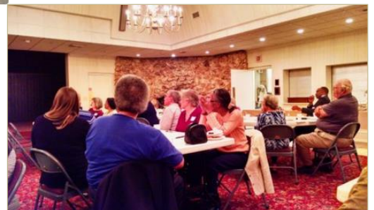
March 9, shared Lenten Fellowship at Church of the Advent. Discussion centered around the impact of "toxic charity" on church outreach in communities.