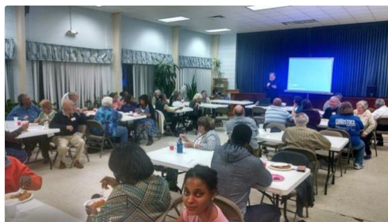
March 2, shared Lenten Fellowship with Church of the Advent, at St. Michael. The word for the evening was Gratitude.

2 nd Annual Arts & Crafts Festival — St Michael & All Angels will host its 2nd Annual Arts and Crafts Festival on Saturday, April 23, 2016 from 10:30am-4:30pm. This year, we have added a special segment titled "Historical Remnants" that will enable parishioners to share historical items (photographs, books, etc.) of family members. The exhibit will be located in the Brooks Room along with Tallahassee African American Genealogy Group (TAAGG).