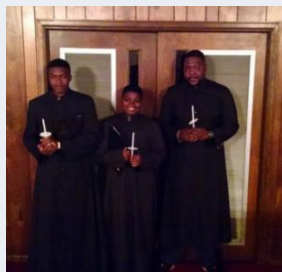
March 6 Compline Service at St. Michael