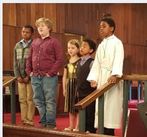
Youth Choir sings the offertory selection at the Eucharist on March 6