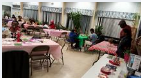
Shrove Tuesday Pancake Supper and Bingo